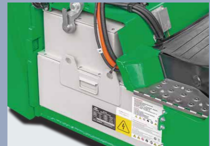
The packs can be easily removed by a manual or electric cart, and can be repaired and maintained conveniently